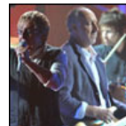
2008 VH1 Rock Honors: The Who