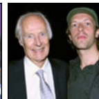
GRAMMY Foundations Stars Night Honoring Sir